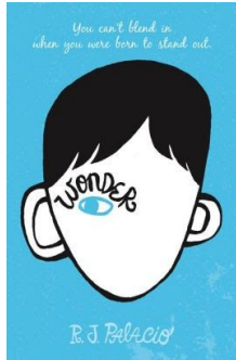
Wonder by R. J. Palacio

This summer every incoming fifth grade student is required to read three wonderful novels. They are: